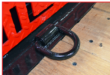
Secure Loads with Multiple D-Rings