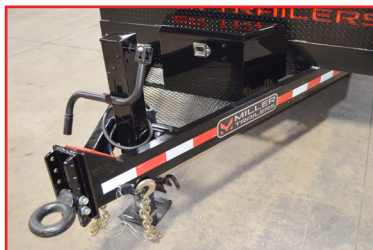
Fully Enclosed Mesh Tongue with Optional Toolbox