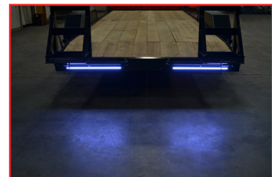
28" LED Tail Lights with Backup Lights