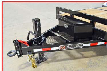
Fully Enclosed Mesh Tongue with Optional Toolbox