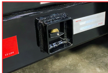
Easily Accessible Hydraulic Damping Valve